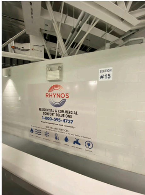
ARENA TRACK WALL SIGNAGE 4' x 6' - $1500 4' x 8' - $1800