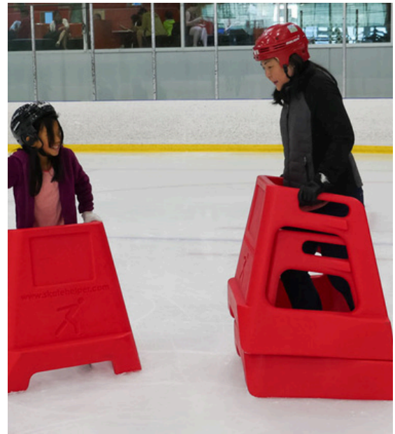
SKATE AID STICKERS 8" x 11" - $250